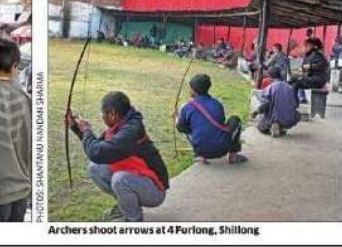
Archers shoot arrows at 4 Purlong, Shillong

In Meghalaya government, said, adding that the state government grants a license only if a Teer counter is situated at least 100 metres away from any place of worship or an educational institution. To set up a legal counter, what is needed is a security deposit of just Rs 5,000 and a quarterly renewal fee of Rs 1,250. "In case of a lottery or casino, ticket price is fixed and prize money is known. But Teer is different," Aja Taher-Mondal, minister for taxation in Meghalaya, told ET. "A number can be bought for ₹1 or ₹10,000. We don't know the total amount of money involved as it is played in cash. Also, the same number can be bought by multiple people and at different counters," he said.