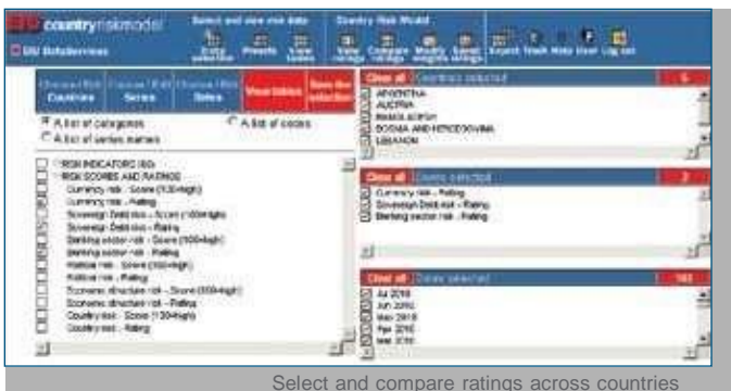
Select and compare ratings across countries